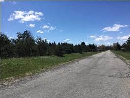
Nice family neighborhood